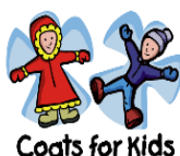
Coats for Kids