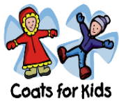
Coats for Kids